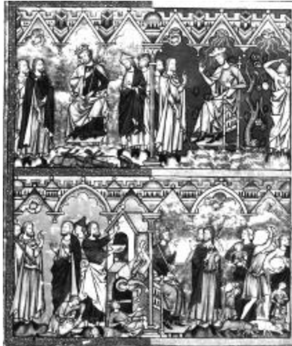
Figure 2. Pestilence, locusts, fire and hail are shown to obdurate pharaoh. then comes the slaughter of the first born (which the Hebrews avoided by marking their door with sheep's blood). Finally the Hebrews are bidden to leave Egypt. (Click on the picture to get an enlarged view. Caution: Image files are large )

event, not exaggerated in the startled eyes of the people experiencing it.